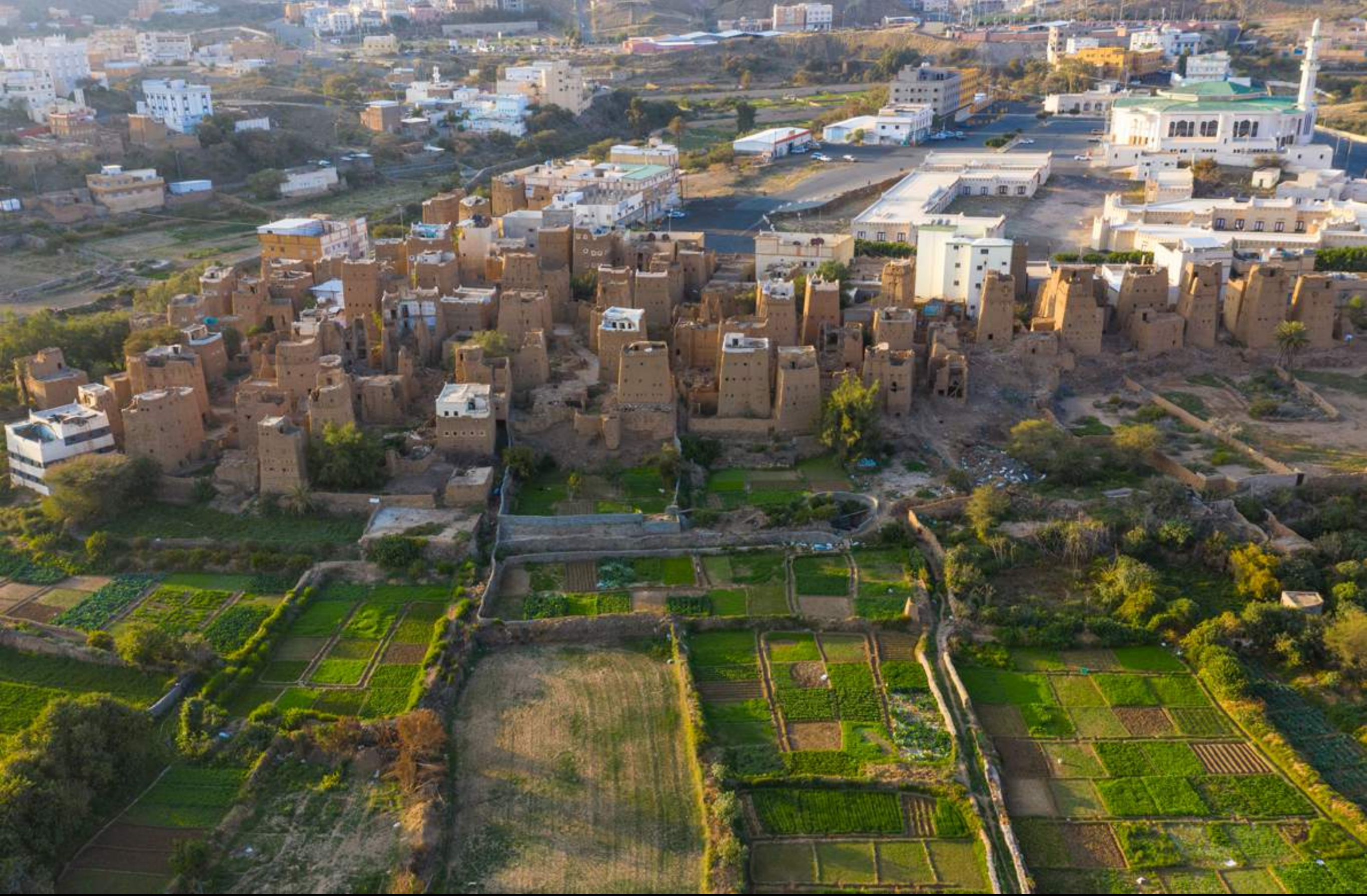
View of an old village with traditional mud houses and gardens on the outskirts of the southern city of Dhahran Al Janub. The architecture bears a similarity to the famous Yemeni city of Shibam, which is called the Manhattan of the Desert. Yemen is only 10 kilometers away. Dhahran Al Janub is not located in the desert but it also deserves such a nickname. The gardens remain well-kept and were used to offer a means of escape in case of tribal raids and defeat.