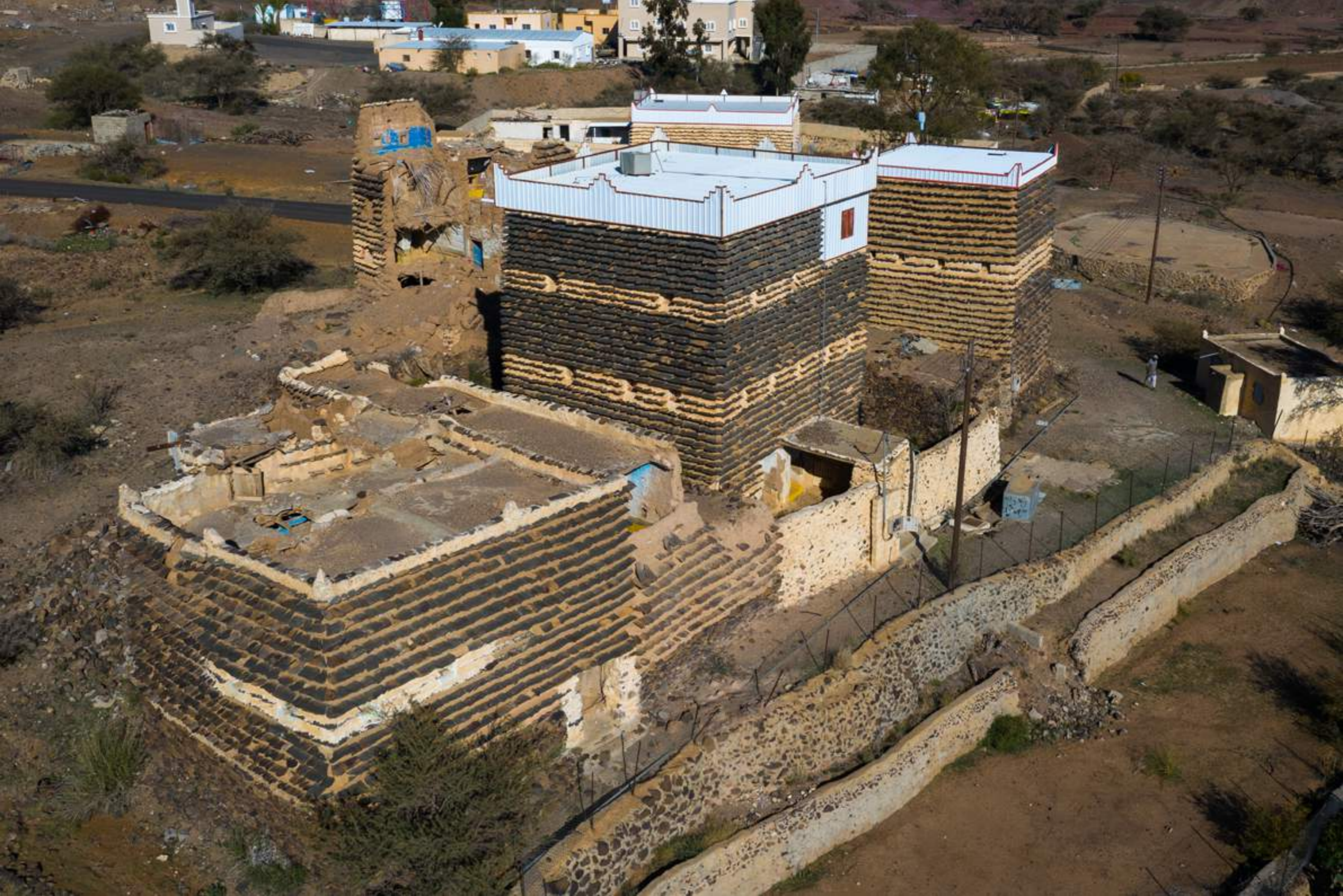
Black stone and mud houses built with slates in the village of Sarat Abidah. While many assume that Saudi Arabia is just a desert, the area is sometimes hit by heavy rain. The angled slates on these buildings help prevent water from getting inside and damaging the walls. The white metallic roofs indicate those houses that have been renovated and are lived in.