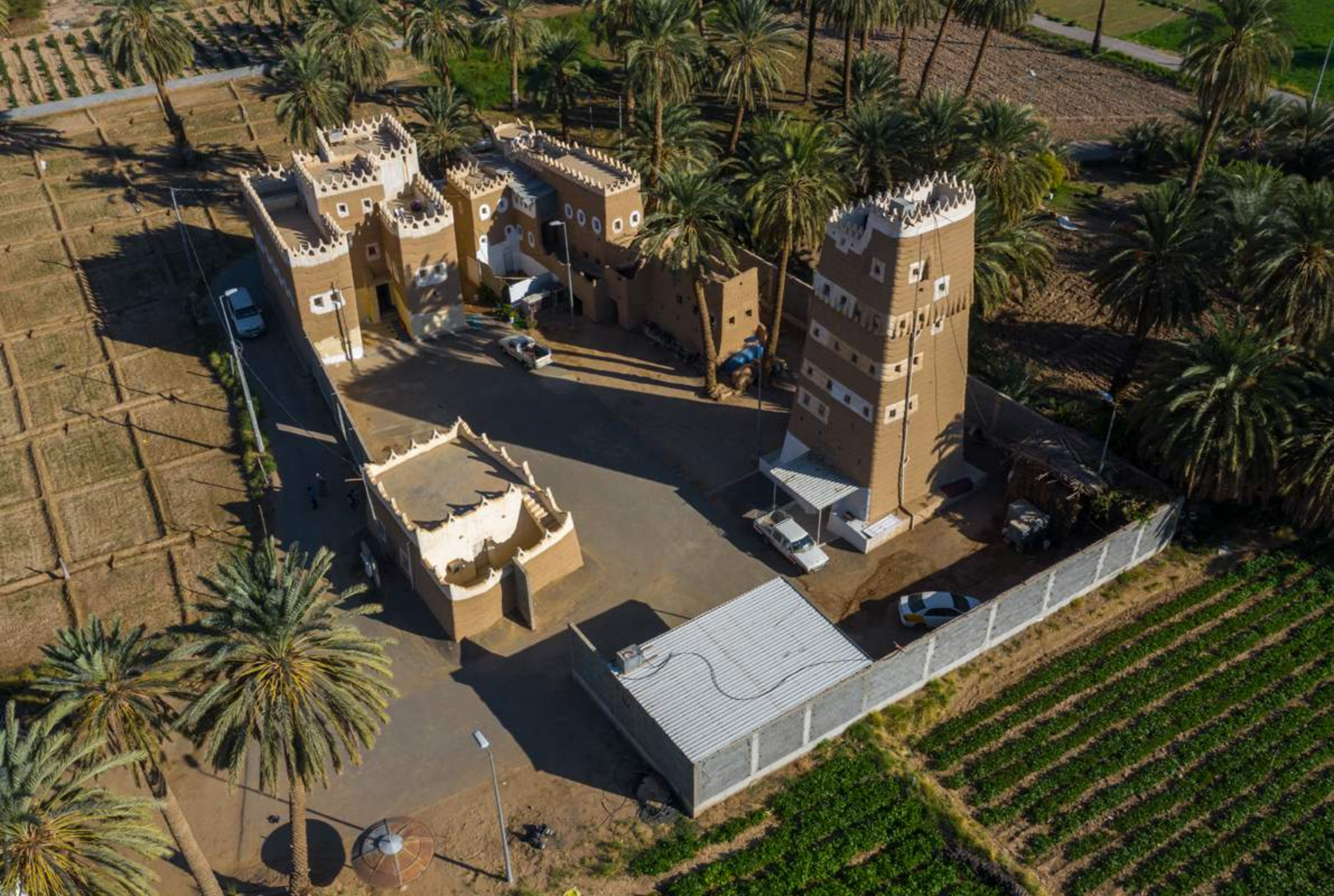
A traditional mud house on a farming complex near the city of Najran. The farm buildings in this area resemble small castles with crenellations. This defensive architectural element indicates that people lived in continuous fear of being attacked. Nowadays, the farmers are always happy to invite you to their homes and share dates dipped in hot ghee.