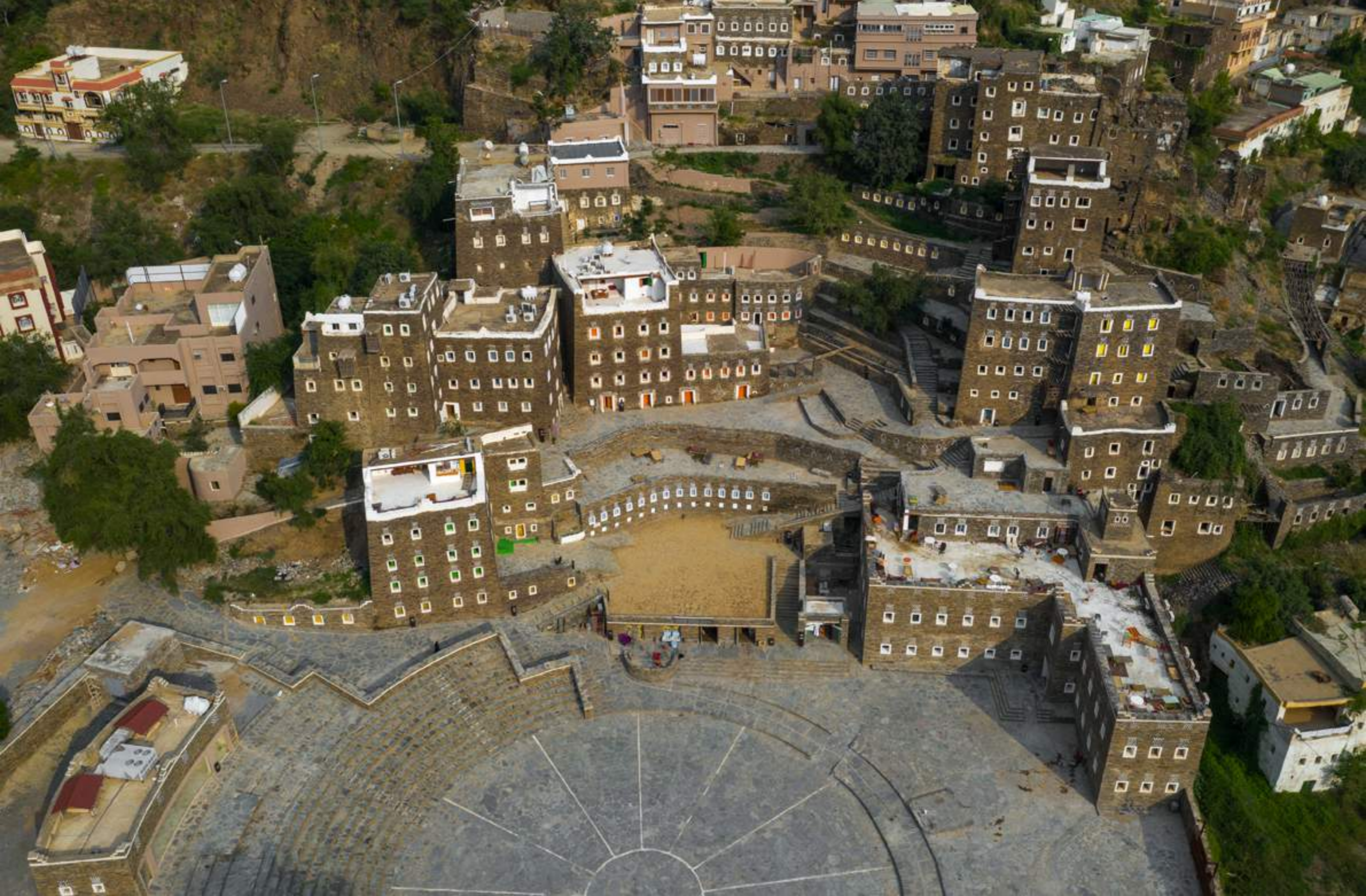
A bird's eye view of Rijal Almaa, in the Asir region. Around 30 years ago, this village was abandoned by the locals in favor of modern houses with electricity and running water. But in a bid to save the ancient buildings, the village has now been turned into a wonderful giant museum. The architecture of the buildings is unique, with stone slabs that were sourced locally. This place will become a major tourist attraction with many hotels opening around it.