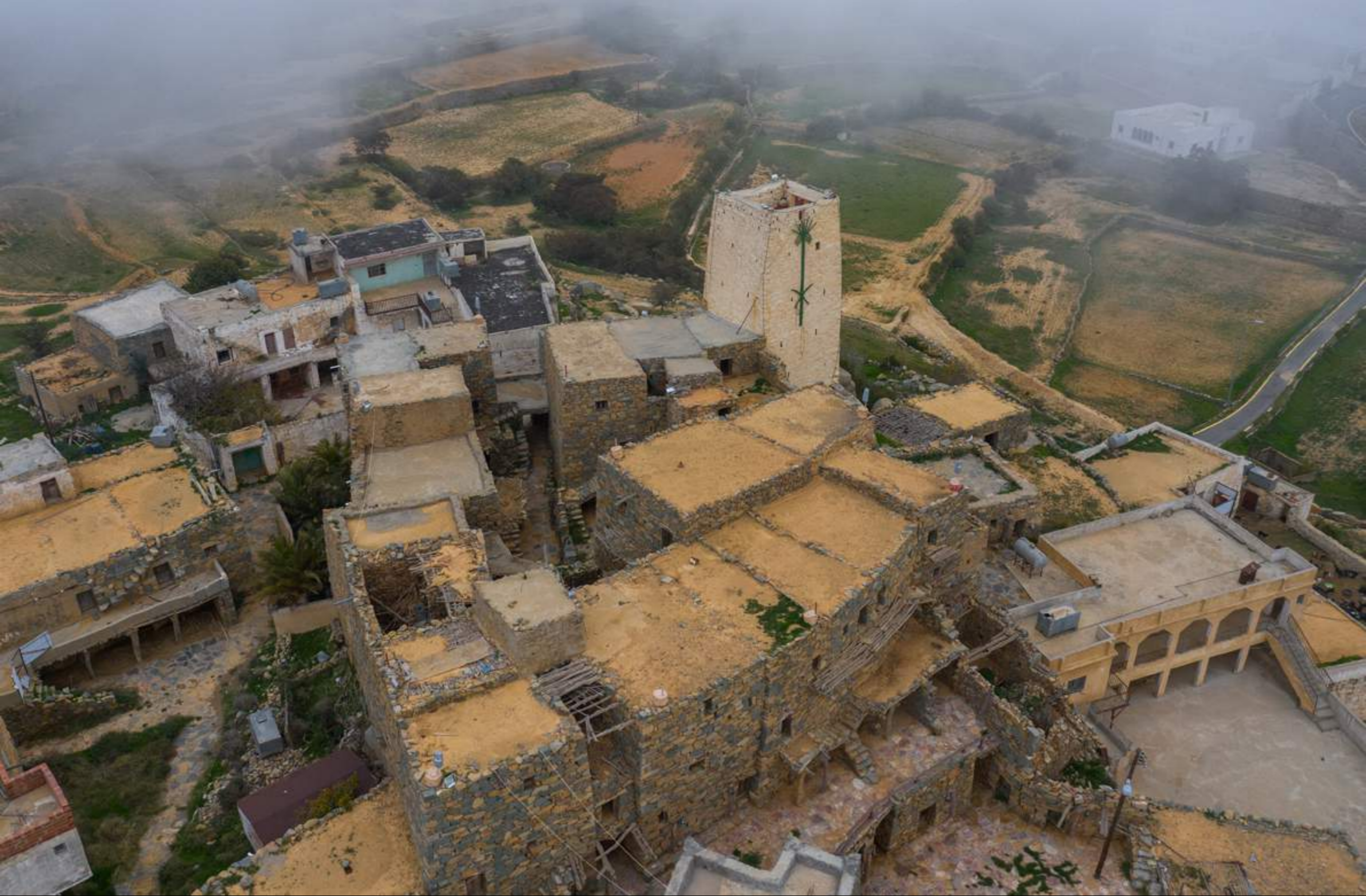
A view of traditional stone houses in the village of Al Olayan. This area is located high up in the mountains and fog is common here. People from the lowlands (Riyadh for instance) enjoy coming here for the rain and the fog during the holidays as the heat becomes suffocating in the cities, with temperatures above 40 degrees and of course, not one drop of rain.