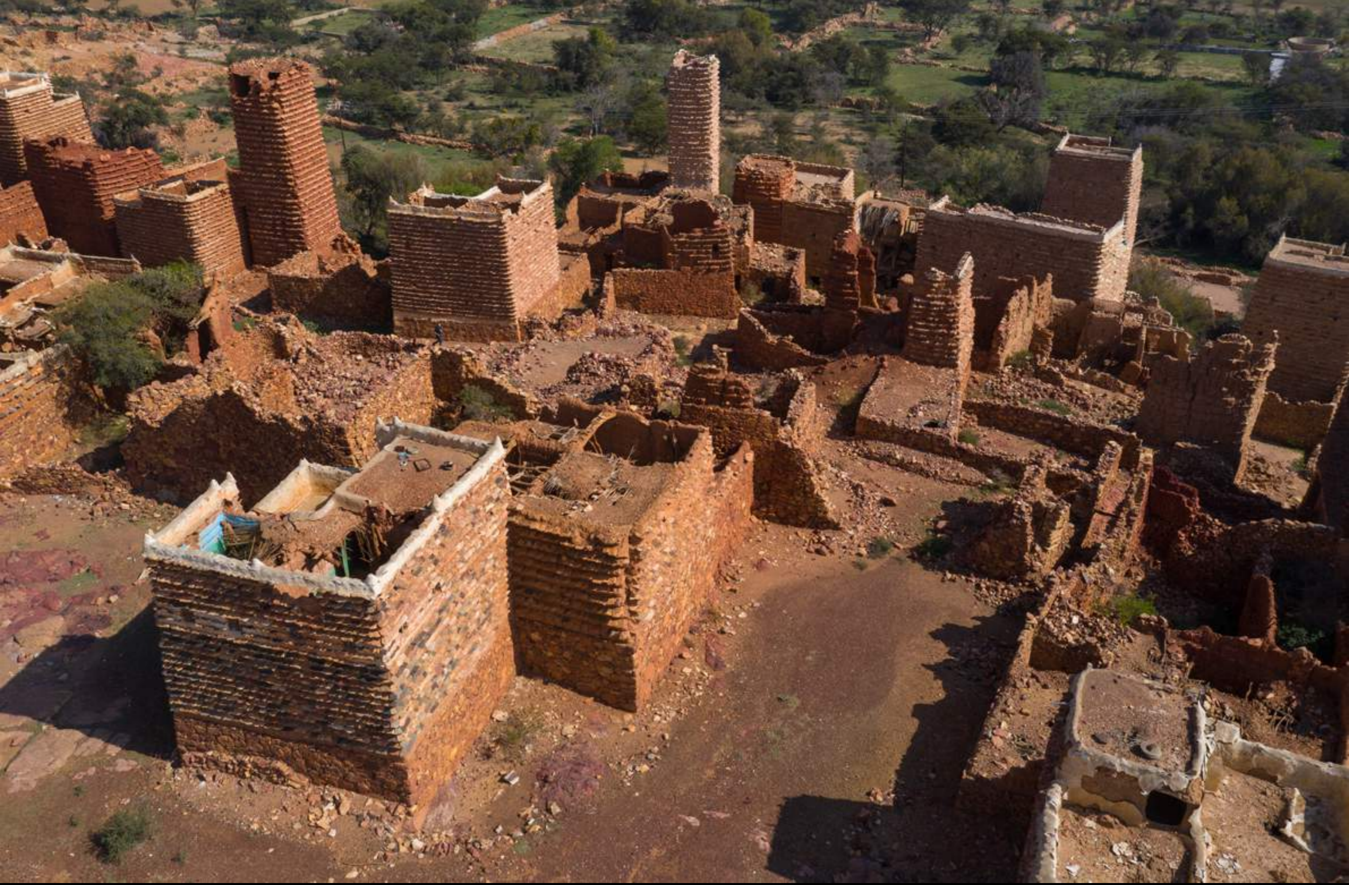
This village is located in the Asir province and features houses made of a unique mix of red mud and stone. Although the properties are now crumbling, there are still colorful drawings decorating the interior walls. The ground floor of these houses was intended for livestock. The first floor was for human accommodation and included small windows to keep out the heat as well as intruders. As you go up the building, the windows become larger to let more light in as well as cooler air.