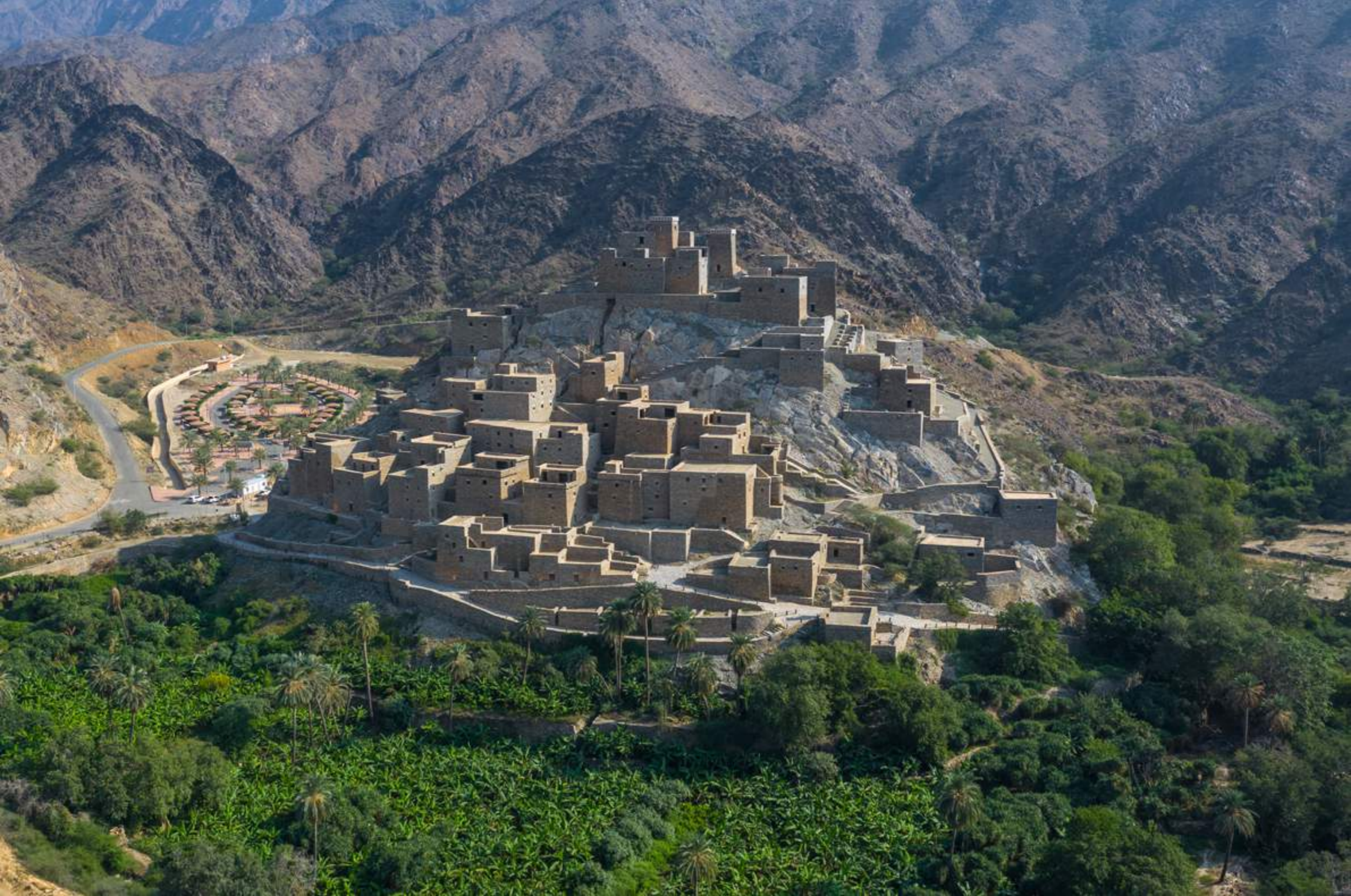
Dhee Ayn village is a 400-year-old stone settlement built on top of a hill in the Al-Bahah region and abandoned about 30 years ago. The village houses themselves are not made of marble but stone. However, the village is known as the "Marble Village" for the rocky outcrop it is built upon.