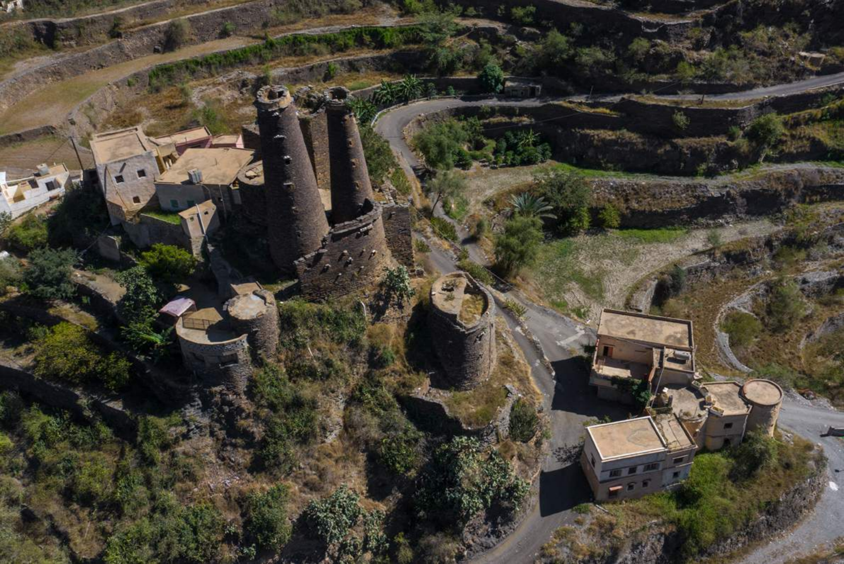
Traditional stone watchtowers standing tall in Addayer village, Jizan province. The terraced land around the buildings allows locals to grow coffee in this remote mountainous area. Saudi people are very protective of their privacy, but when shown these drone pictures, they were excited to see their land from above for the first time.