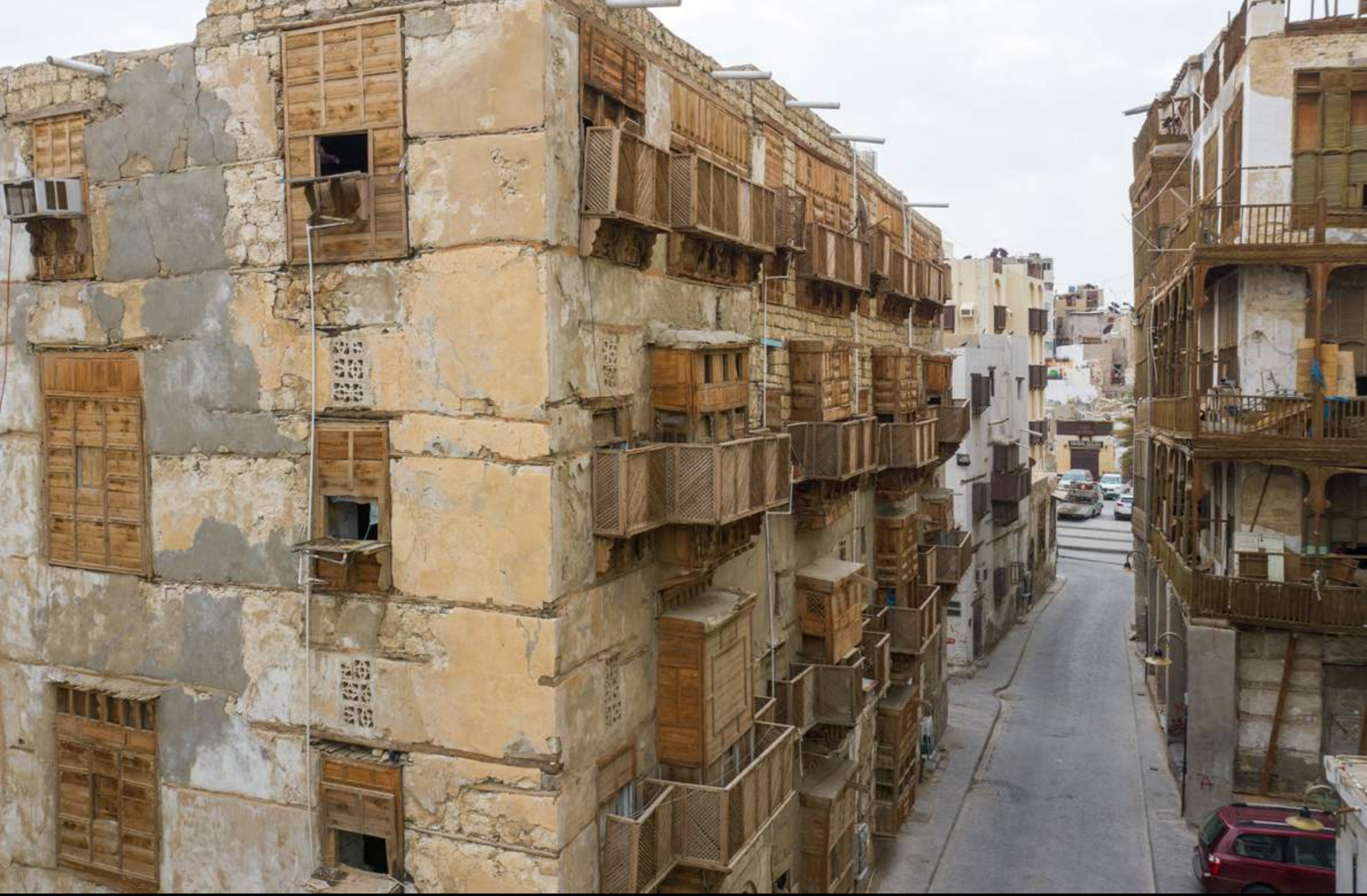
Old houses in the al-Balad quarter in Jeddah. This district is a UNESCO World Heritage Site and there is ongoing conservation work led by the Ministry of Culture. It is extremely reminiscent of the Tales from the 1001 Nights: tall buildings topped by mashrabiya, wooden balconies that allowed women to see without being seen. Saudis have fled the old city and now, only workers or refugees from Somalia, Pakistan and Yemen live here in precarious conditions.