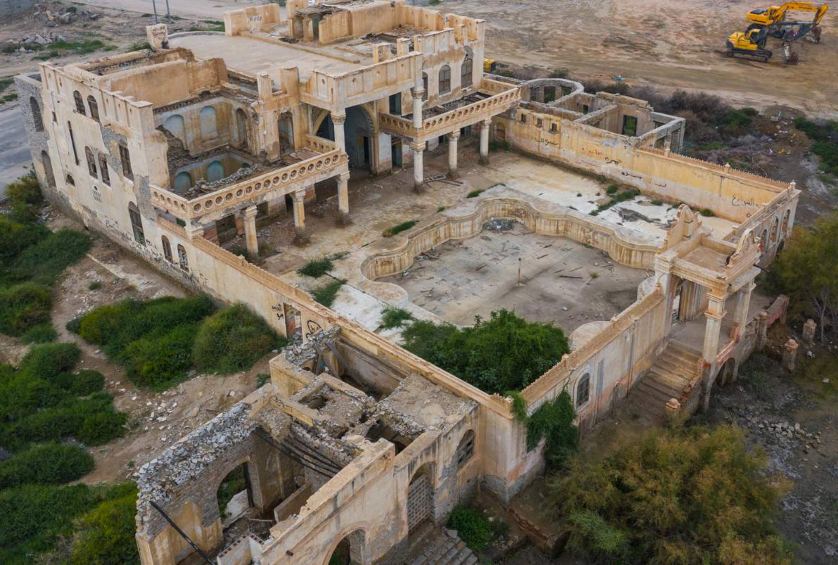
A view of the abandoned Abdullah al-Suleiman Palace in Taif, Mecca province. Many old palaces in the area that combine Ottoman, Arabic and Art Nouveau styles are awaiting cash injections from benefactors in order to be renovated. But help never comes and many are left in ruins living under the threat of real estate speculation.