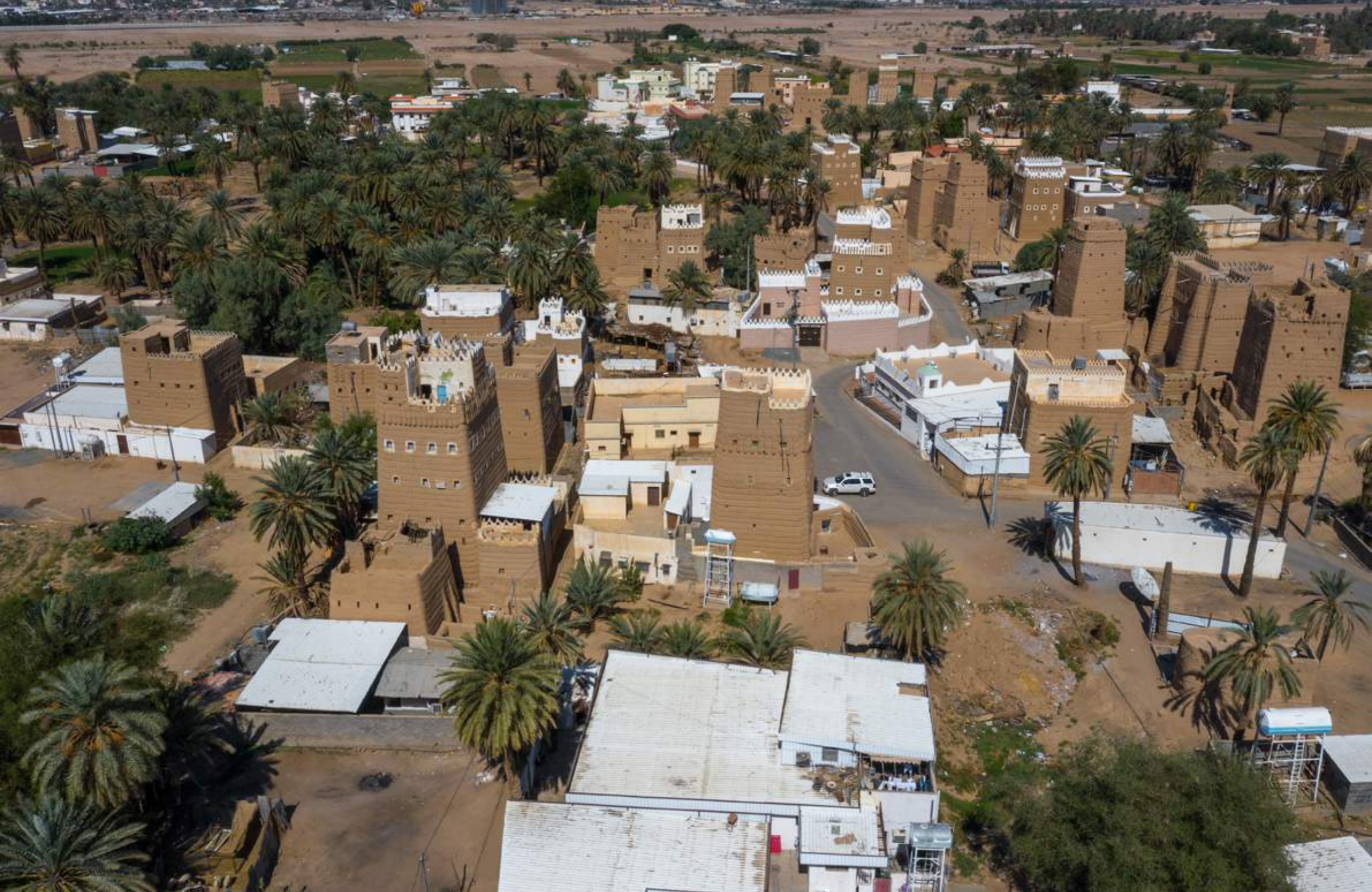
An ancient village with traditional mud houses near the southwestern city of Najran. An increasing number of these mud houses have been abandoned in favor of modern ones, but Saudi families like keeping them for weekend getaways or social events such as weddings or Ramadan gatherings. This frequent use means that these 200-year-old houses remain well-maintained. Many Saudis also like building a modern house close to their old family one.