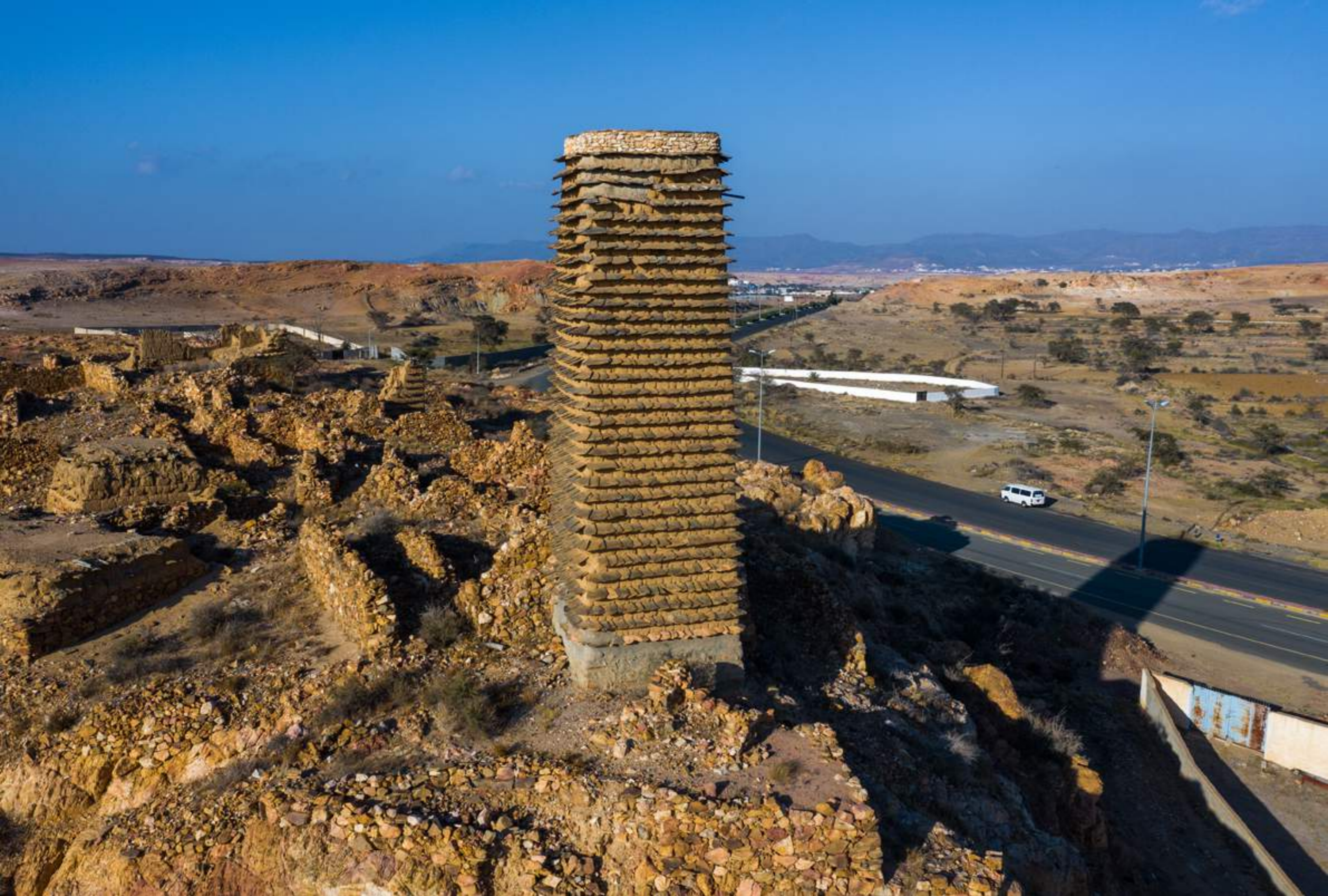
A stone and mud watchtower made of slates standing in the Asir province of Saudi Arabia. These watchtowers had two purposes: to monitor neighboring enemies and to keep harvests safe in this arid area. Nowadays, they have become the symbol of Asir province and can be seen all along major roads.